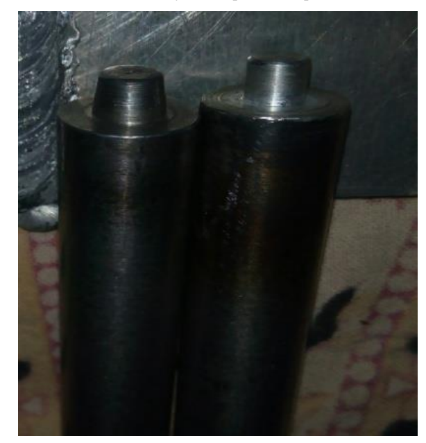
Fig. 2 Tool Snapshot: 1) Tapered (left) 2) Cylindrical (right)

The Fig. 2 represents the 2D diagrams of the tool profile. The length of the tool is 75mm whereas the height of the tool probe is nearly equal to the thickness of the materials, i.e., 5.9mm. Initially a long Aluminum plate was taken and sectioned according to the required dimensions (100x55x6mm). After the sectioning, the plates were properly clamped in the designed fixture setup for the welding operation. Subsequently, the tool (H13 steel material) was used and the welding process was completed at three different speeds while maintaining a constant feed. The welded plates can be seen in the Fig. 3 below which was welded using the threaded tool at 1200rpm with a feed of 25mm/min. The welded plates were first sectioned according to the tensile specimen test dimension standards and the tensile strength test was conducted on the Universal Testing Machine (UTM).