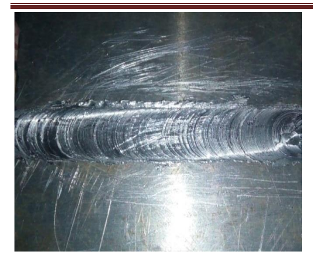
Fig. 3 Snapshot of AA plates welded at 1200 rpm