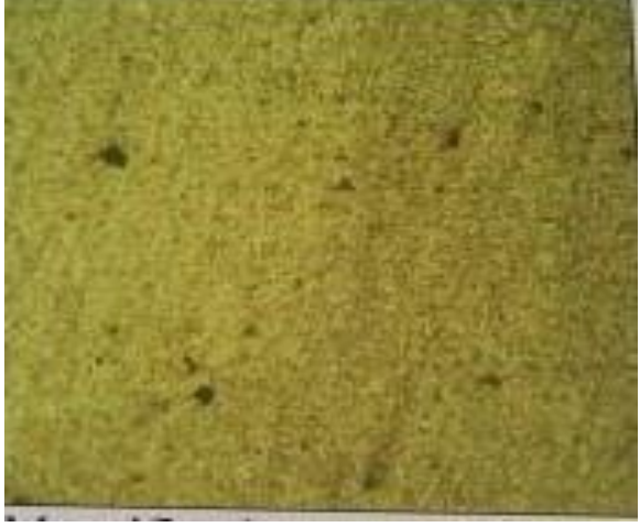
Fig. 4 Microstructure image at magnification 200X

The test was conducted as per the ASME guidelines and was free from cracks and voids. The slag and inclusions level were found to be satisfactory. As we can see in Table III, that when the microstructure test is done at magnification of 200X then the observed result was that the welded material consists of fine inter-dendritic network of eutectic silicon in aluminium solid solution with the help of ASM9-2004. As well the microstructure image shown below in Figure 4 contains no voids and having a great strength.